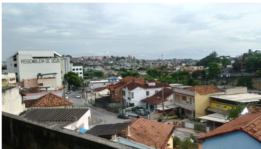
Figure 2. View of Brás de Pina from Ruth's house

The theme of first photo that Ruth showed me was the home and housing (Figure 2). The structure of the walls and roofs is one of the layers that represent the house. But she went further. It is in the home where memories are kept, where ways of being in the world are hidden. At home, refugees have their sense of belonging, of fixing their trajectory.